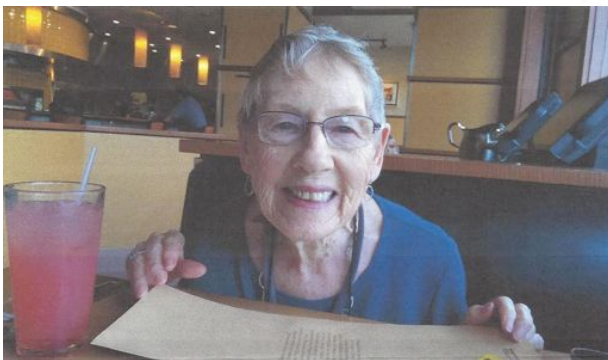
At pizza, before the celebration.