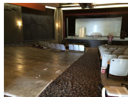
About half-way done