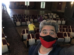
Volunteers at Work