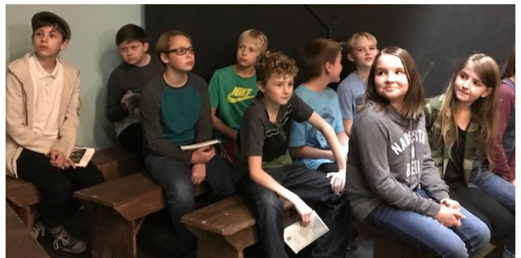
The youngest cast members of A Christmas Story hard at work!