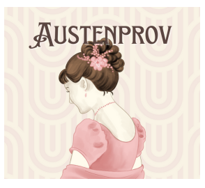
Austenprov Organized by Diana Holdridge

Don't miss out on the new black box theater space with these amazing shows!